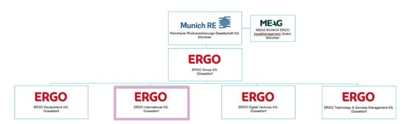
Figure 1. Structure of Munich Re and ERGO Group AG

The Company is 100% owned by ERGO International AG, Germany, which is part of the ERGO Group AG, Germany, which in turn is part of the Munich Re Group (Münchener Rückversicherungs-Gesellschaft AG, Munich). ERGO Group is one of the major insurance groups in Germany and Europe, offering a comprehensive spectrum of insurance services.